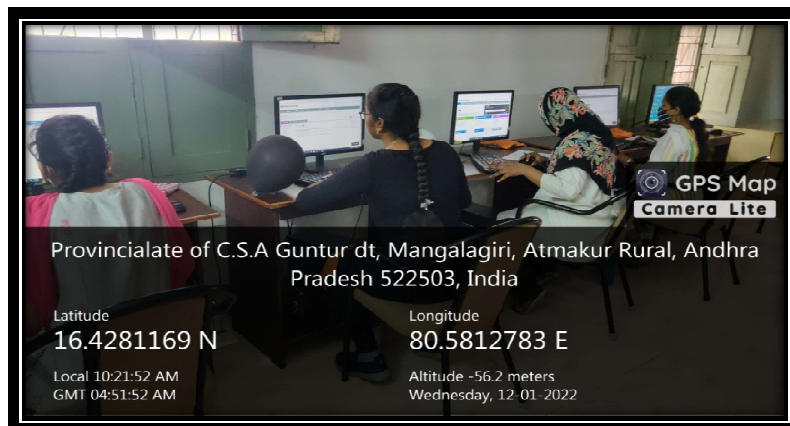
e-learning facility to the students

Ph: 08645-236255, 236722, 9912342142 E-mail: ncpa_csagp@yahoo.co.in Web site: www.ncpacsag.ac.in